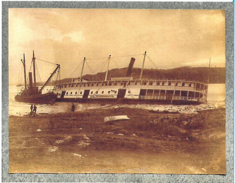
“The Hasbrouck” grounded near New Hamburg