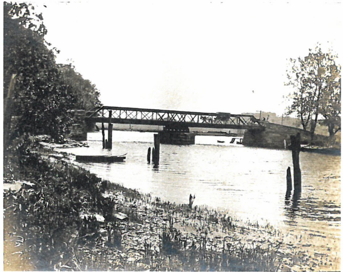
Horse and Buggy crossing Drake's Drawbridge